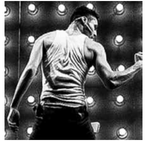
BROTHERHOOD: THE HIP HOPERA OCTOBER 22 & 23